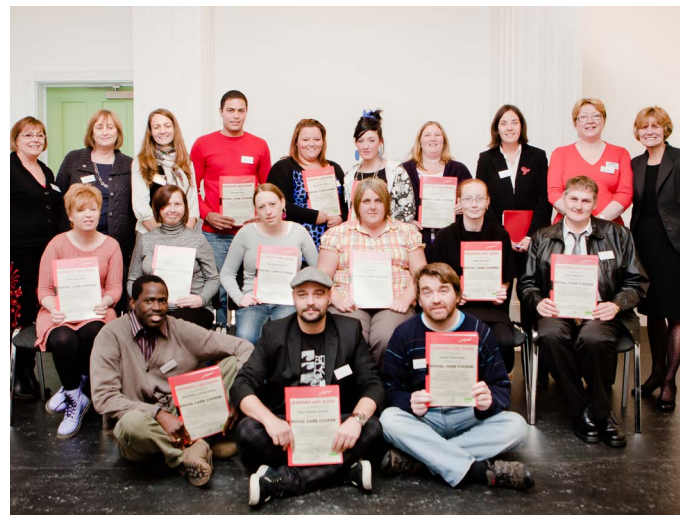
Celebrating the completion of an employability course

Helping peoples' recovery from addictions and towards a safer, healthier and more productive life. Cyrenians services provided case-work for 71 people to build a sustainable life away from drug and alcohol use. Of people engaging with key-work support in parallel with specialist treatment, the service has a 96% success rate measured as people making progress in their plans