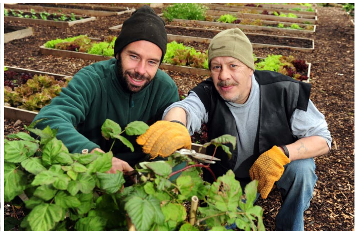
TOP: Dinner at the Communities. LEFT: Homelessness Prevention Service befrienders. RIGHT: Community Gardens.