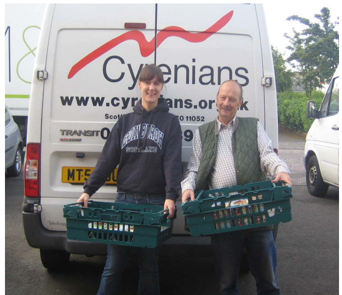
Cyrenians Good Food depot.