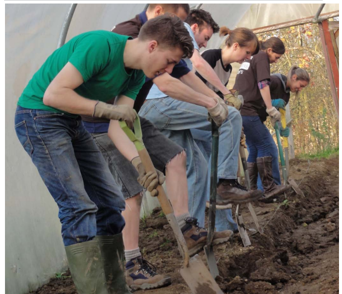
Team challenge at Cyrenians Farm.